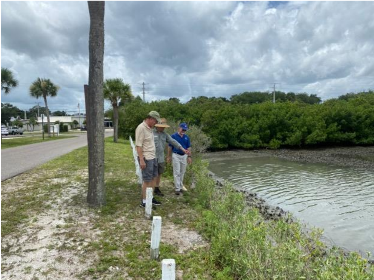
North shore of Kennedy Park