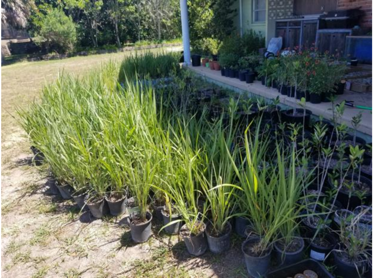
Plant staging area.