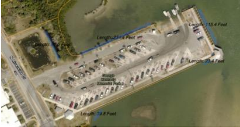
Kennedy Park, Edgewater Florida