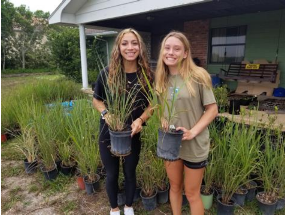
Riverside Young Leaders in Conservation