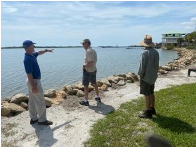
Sunrise Park Site Visit