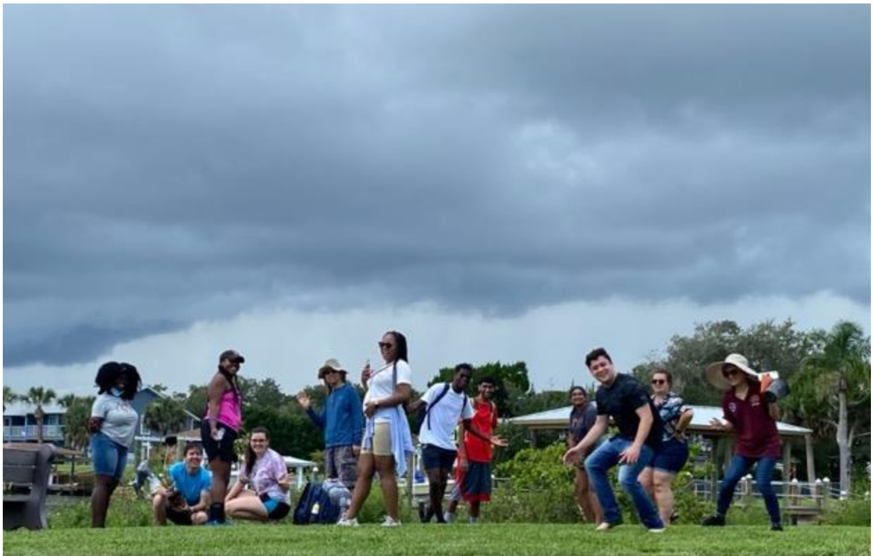
Veteran's Park Planting, Edgewater, FL