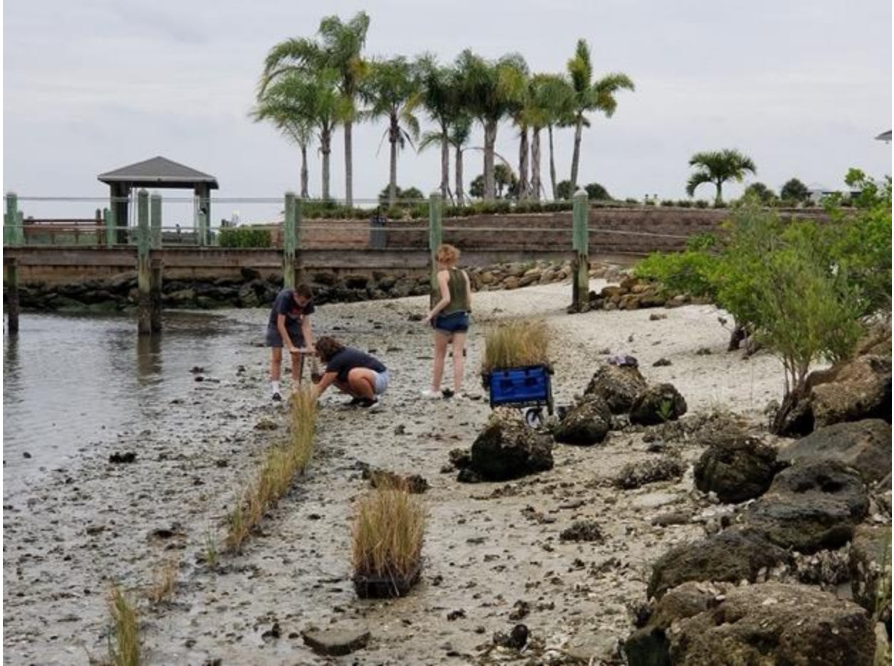
Planting the rows of Spartina alterniflora .